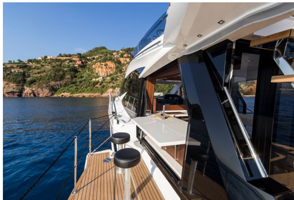
— Serve drinks outside and impress your guests