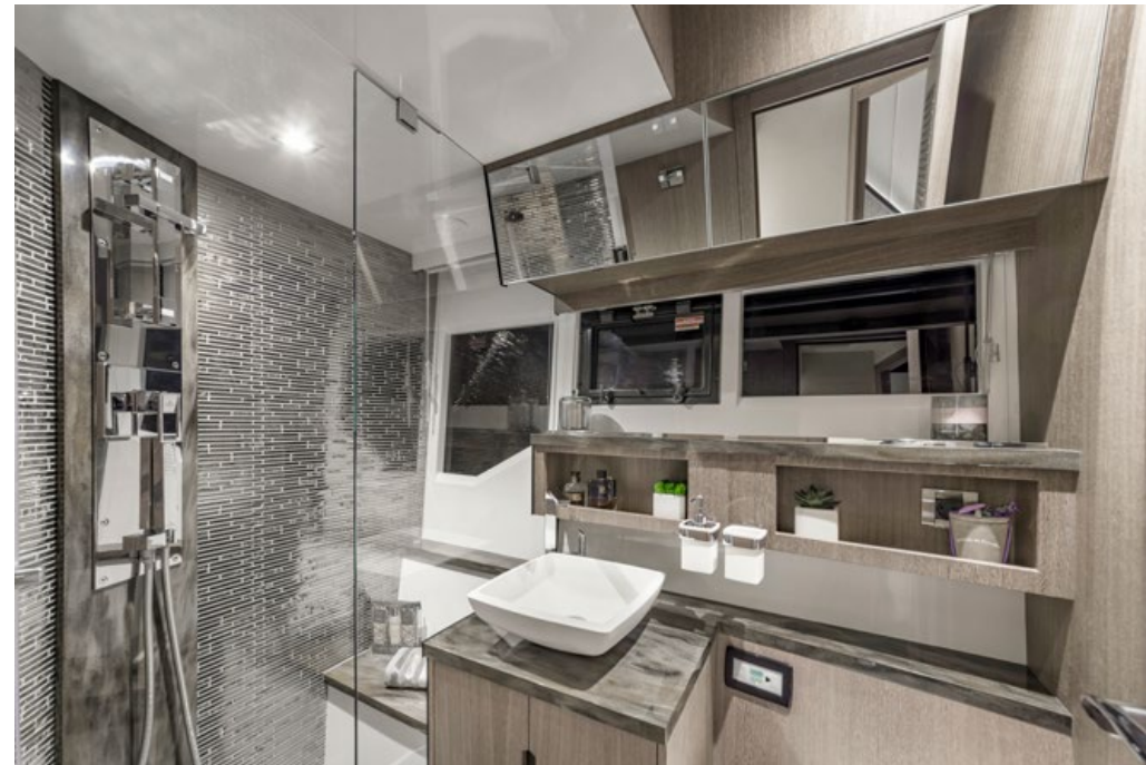
Two bathrooms are located below deck —