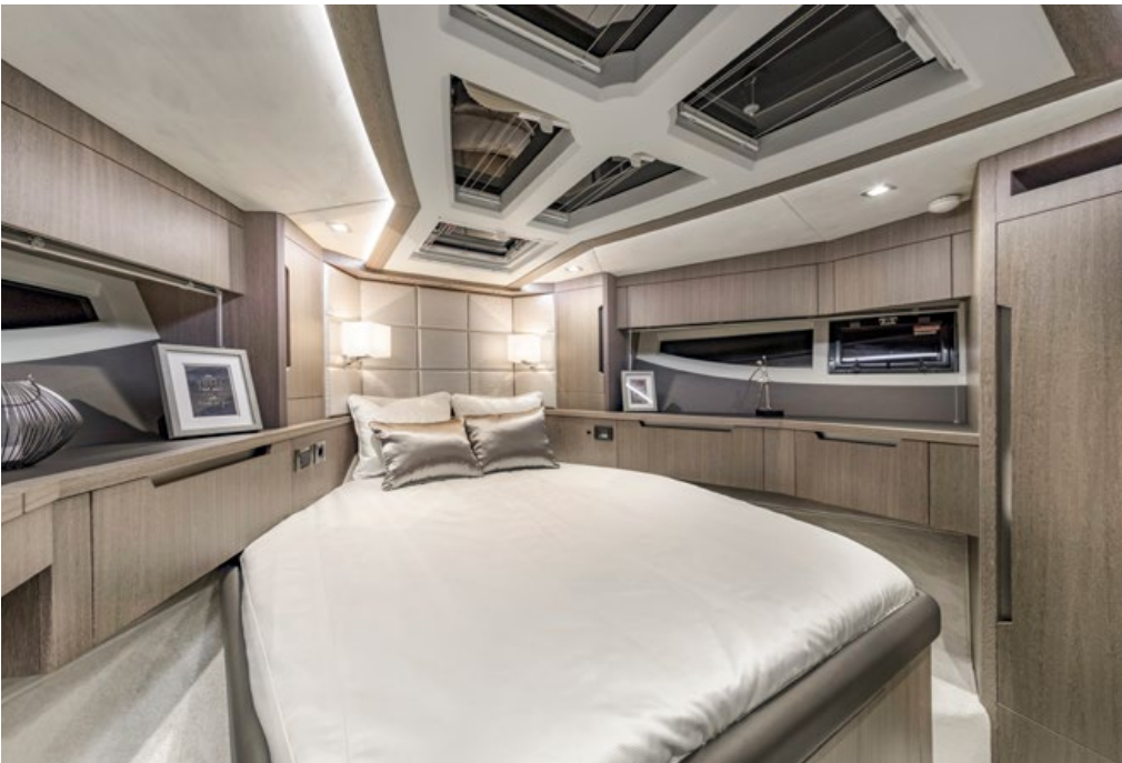
Forward VIP cabin is brightened by a series of skylights —