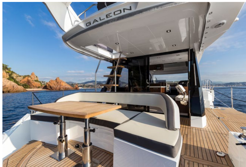
— Rotate the aft seat 360°