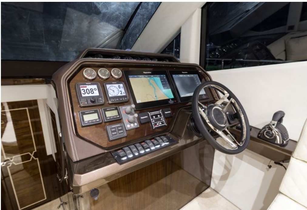
The helm can be fitted with a variety of navigational equipment —