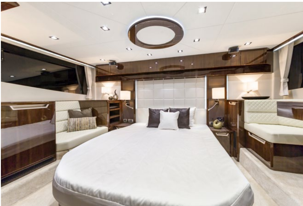
A luxurious owner's cabin —