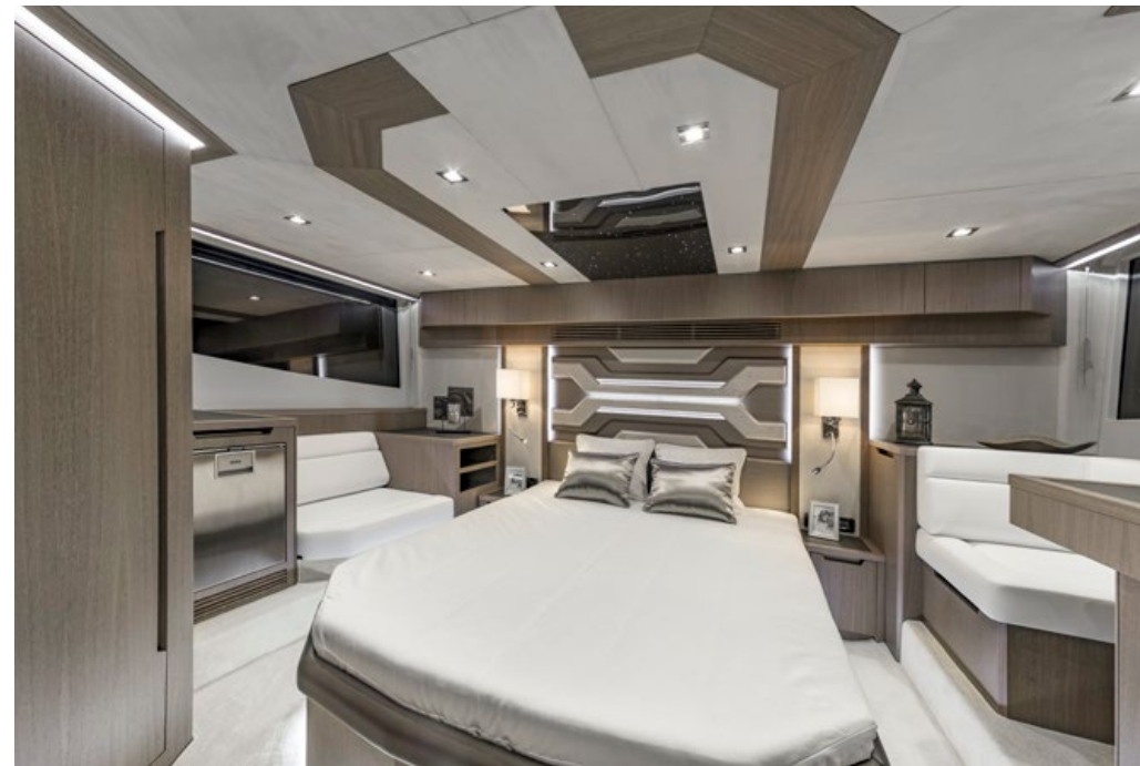
The owner's cabin located midship offers great space —