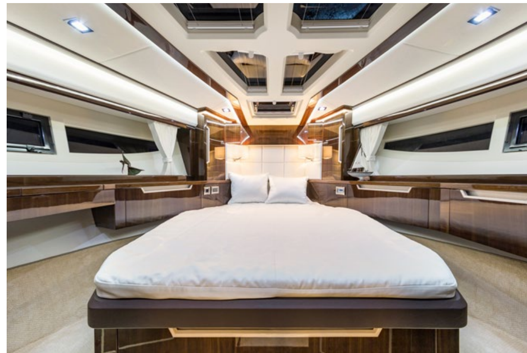
The forward VIP cabin with a double bed —