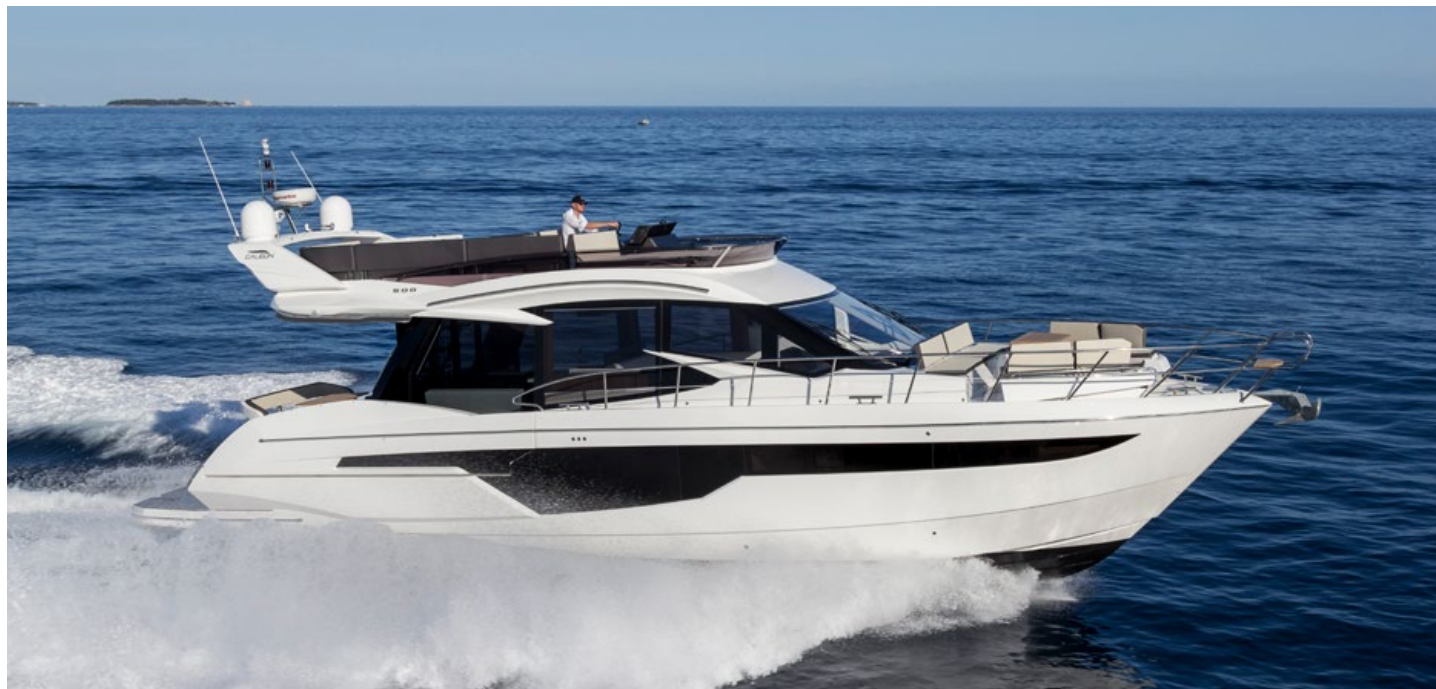
The stunning exterior of the 500 FLY —