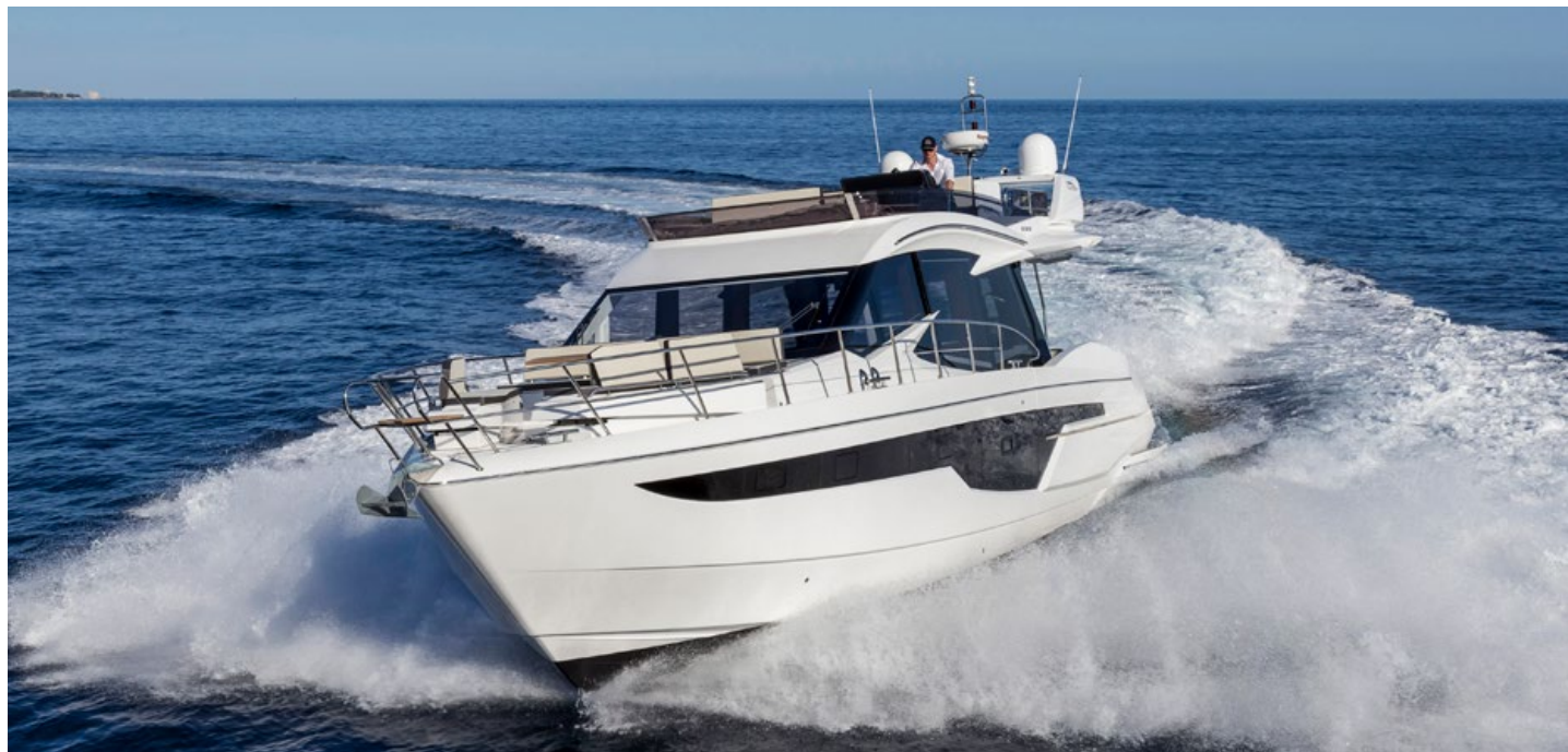
Supreme handling and performance —