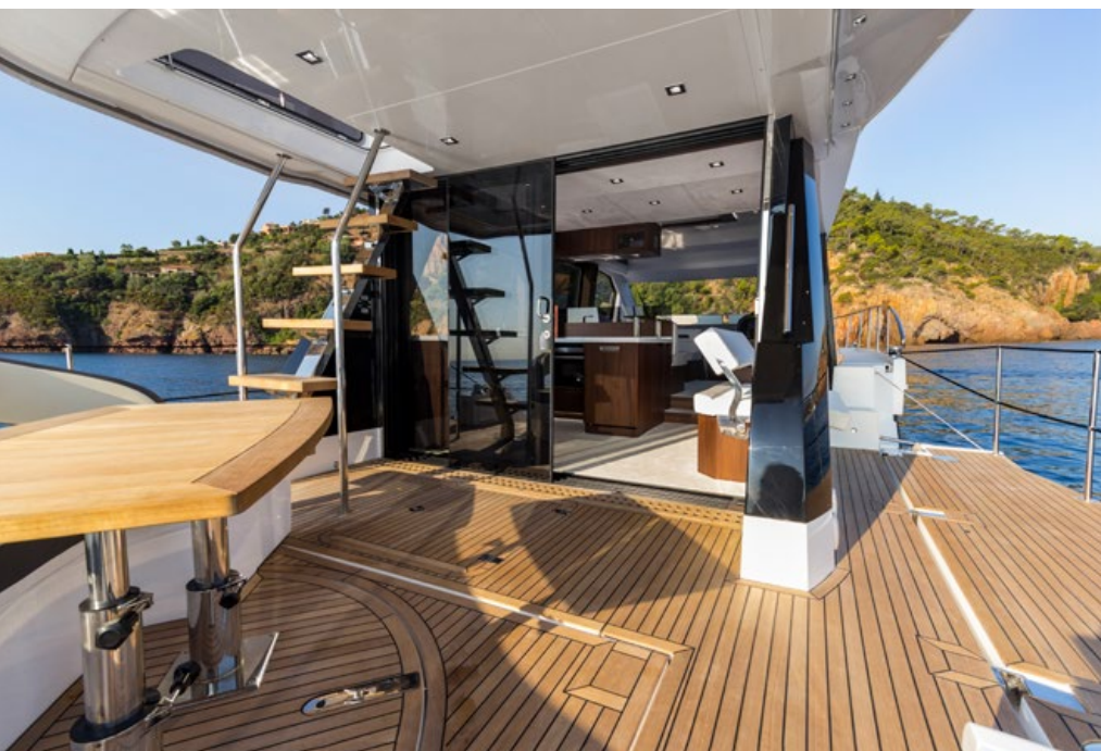
— Drop down the sides and enjoy the incredible cockpit area