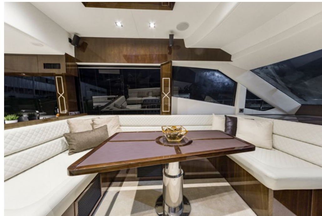
The table can be lowered to create an extra berth - smart! —