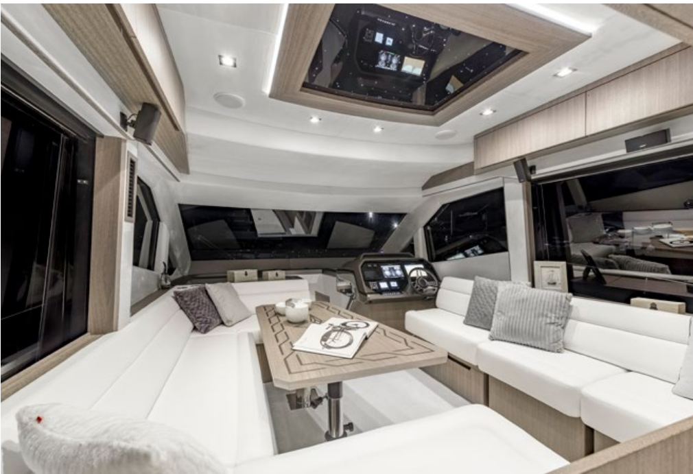
The entertainment area with a pop-up TV —